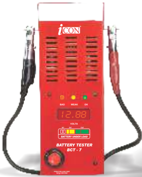
BCT - 7